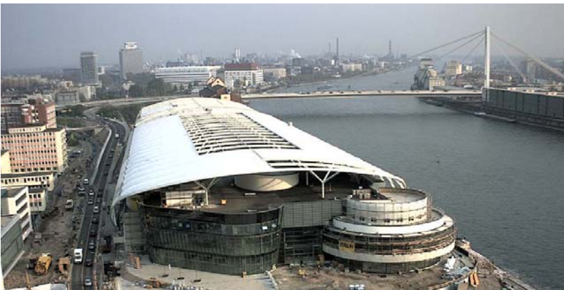
Photos of assembly

A translucent membrane roof construction spanning the complete shopping mall which is to be illuminated by night give a unique and unmistakable character upon the spectacular architecture.